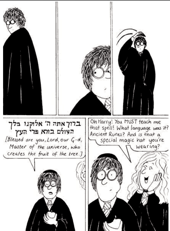
Harry Potter's darkest secret is discovered.